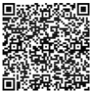
AR / VR